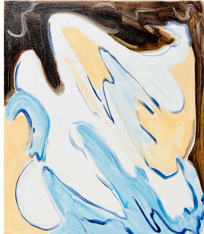
ocean of noise