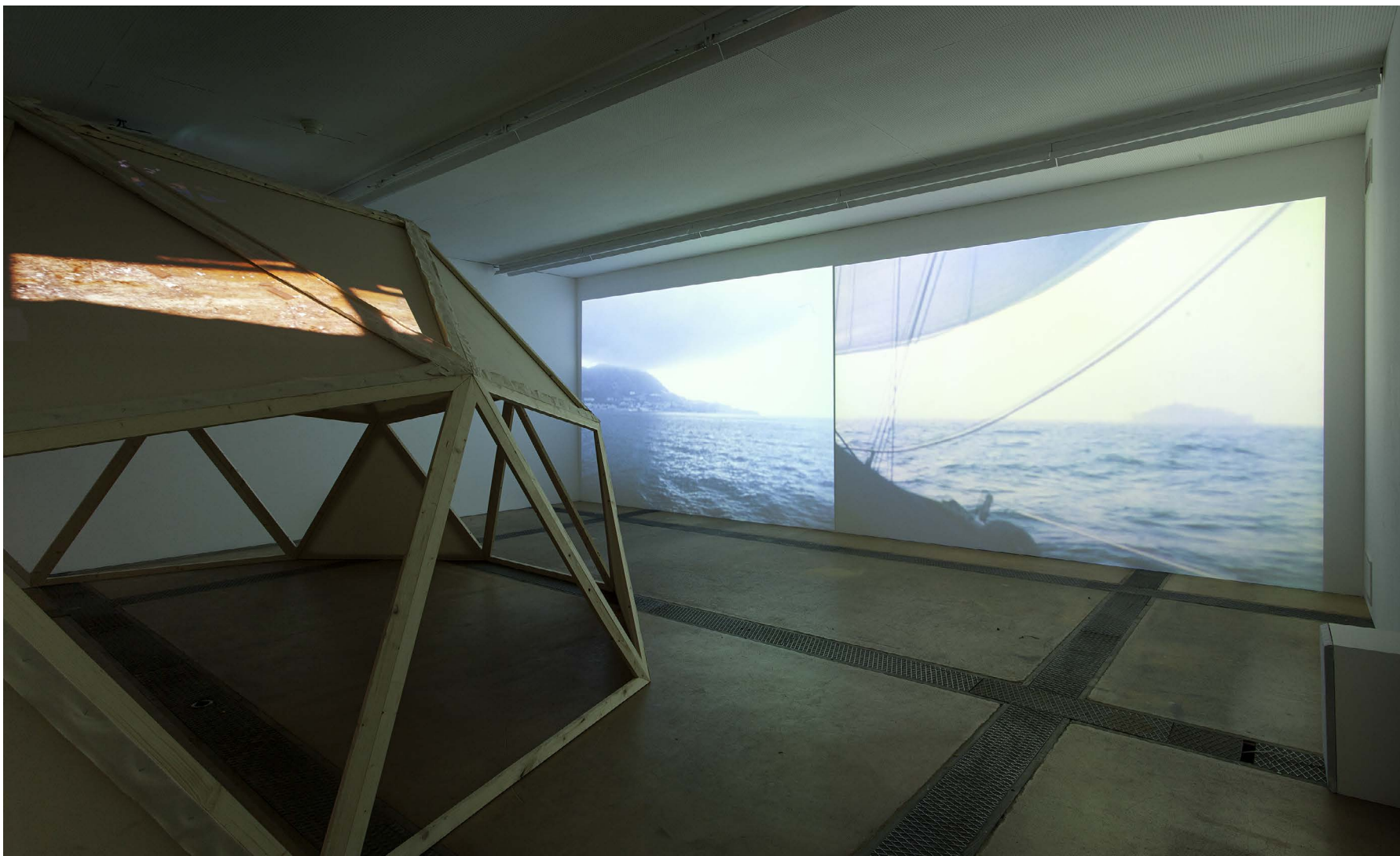
The great Empire of Tivoli (left)