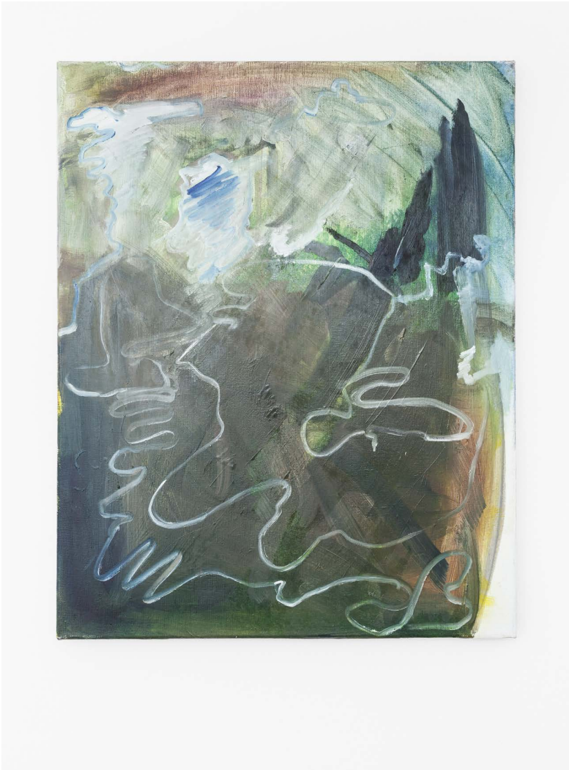
Empire oil on canvas, 45 × 50 cm, 2014 Villa Bernasconi, Grand-Lancy, May 2014