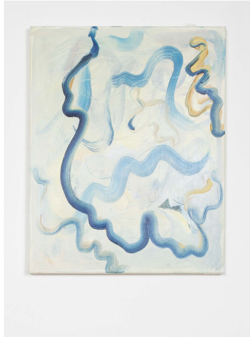
Méditerranée oil on canvas, 30 × 40 cm, 2014 Villa Bernasconi, Grand-Lancy, May 2014