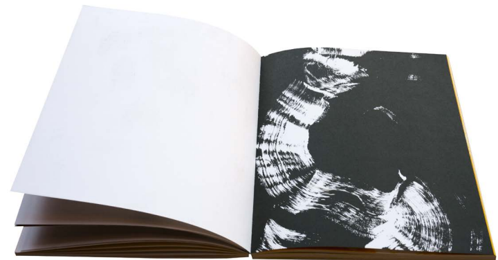
77 artist's book, offset, edition of 100 Miami books, Geneva, 2013