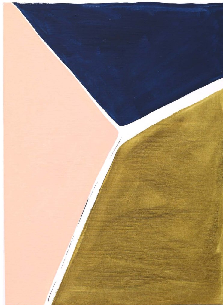
Edge oil on canvas, 45 × 60 cm each, 2014 La Rada, Locarno, 2015