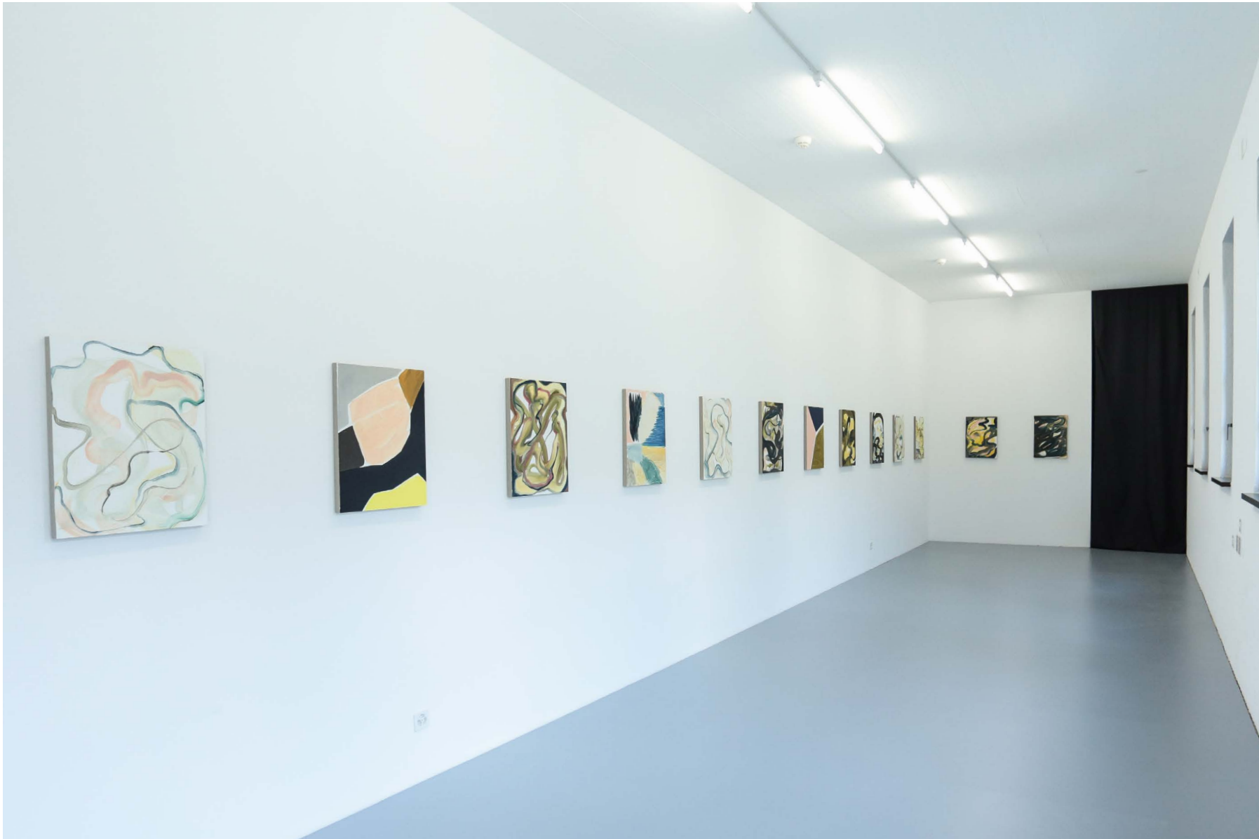
A Momentary Lapse of Reason exhibition views, oil on canvas, 2015 La Rada, Locarno, 2015